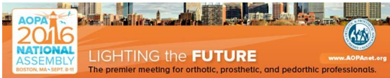
Exhibit at the 2016 National Assembly in Boston, MA!

AOPA is currently accepting exhibit applications for the 2016 AOPA National Assembly, which is due to take place in Boston, MA on September 8-11, 2016. The Hynes Convention Center will serve as the event's venue. This event, the oldest and largest of its kind in the United States, will feature dedicated tracks of the most relevant education for prosthetists, orthotists, technicians, pedorthists and business managers.