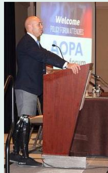
Rep. Mast (R-FL)

Use www.AOPAvotes.org to voice your support for the Medicare O&P Improvement Act.