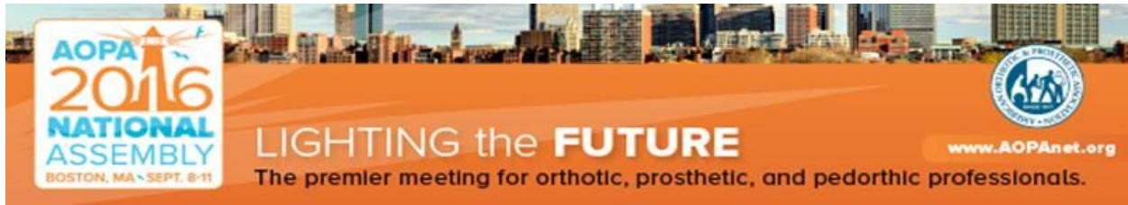
Exhibit at the 2016 National Assembly in Boston, MA!

AOPA is currently accepting exhibit applications for the 2016 AOPA National Assembly, which is due to take place in Boston, MA on September 8-11, 2016. The Hynes Convention Center will serve as the event's venue. This event, the oldest and largest of its kind in the United States, will feature dedicated tracks of the most relevant education for prosthetists, orthotists, technicians, pedorthists and business managers.