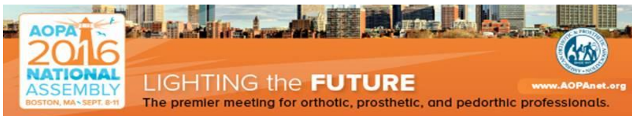
Exhibit at the 2016 National Assembly in Boston, MA!

AOPA is currently accepting exhibit applications for the 2016 AOPA National Assembly, which is due to take place in Boston, MA on September 8-11, 2016. The Hynes Convention Center will