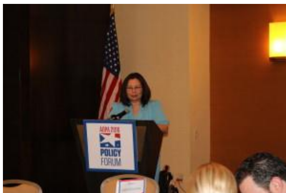
Rep. Duckworth addressing participants