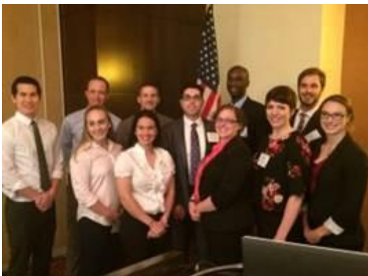
The O&P Students, attended with support from NCOPE