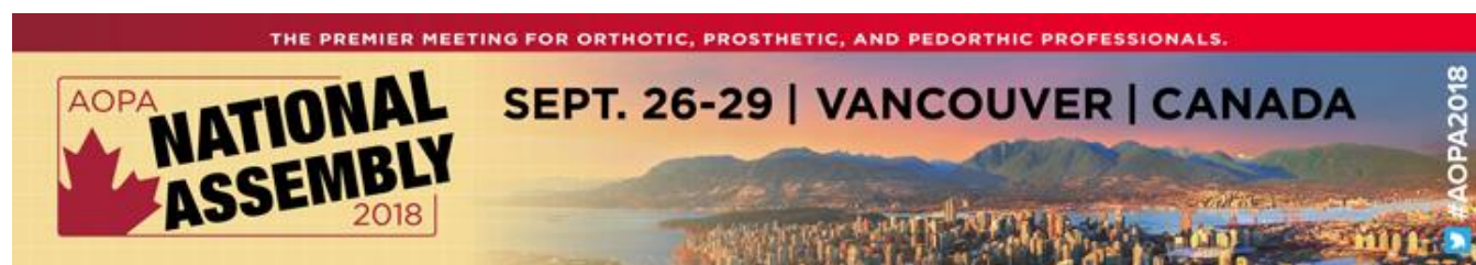
Exhibit at the AOPA National Assembly – Sept. 26-29 in Vancouver, Canada

AOPA is currently accepting exhibit applications for the 2018 AOPA National Assembly which is to be held September 26-29, 2018 in beautiful Vancouver, Canada. Now is your chance to sign up and showcase your products at the largest O&P tradeshow in the Western Hemisphere. This world-wide convention opportunity features 4 days of high-level networking, exhibits, the latest techniques in O&P treatment, and the finest industry specific business and clinical training programs. We hope you make plans to join us.