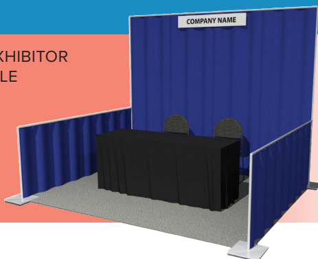
FIRST-TIME EXHIBITOR SET-UP SAMPLE